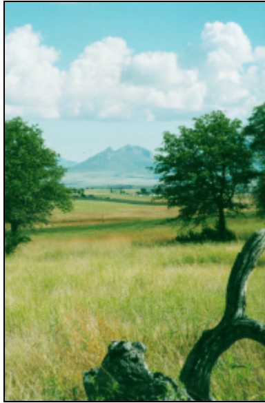
View toward the Mustang Mountains from Lot 4.