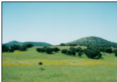
Partial view of Lot 3 with the Canelo Hills in the background. Taken from the grassy swale on Lots 3 & 4.