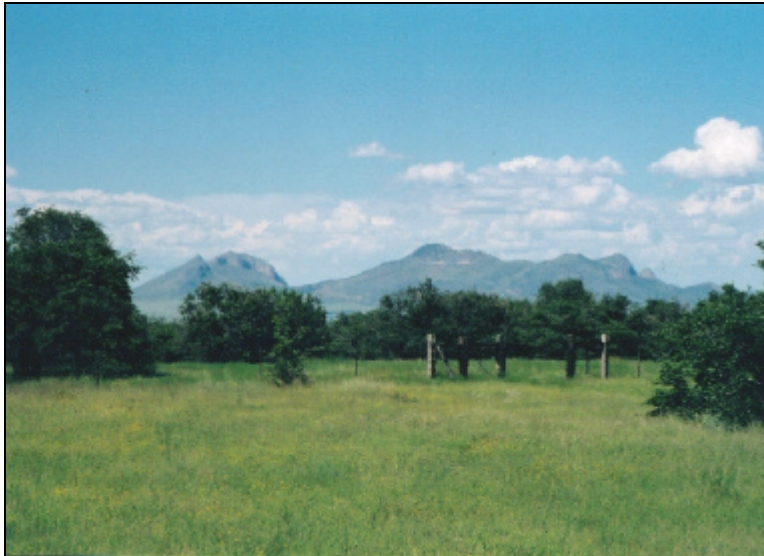
View toward the Mustang Mountains from a home site on Lot 2.