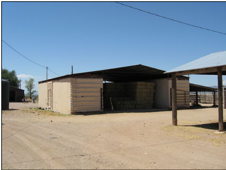
Hay Barn/Tack Room