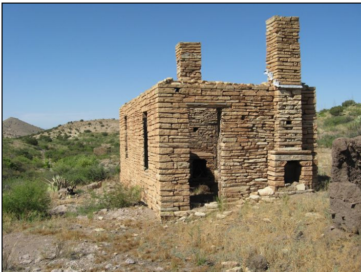
Gillman Homestead Ruins