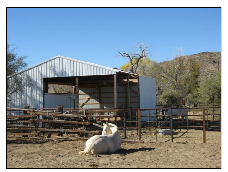
Corrals and Hay Barns