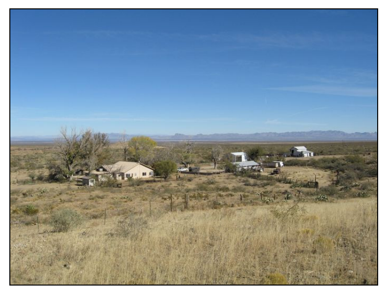
View of Headuqarters Improvements