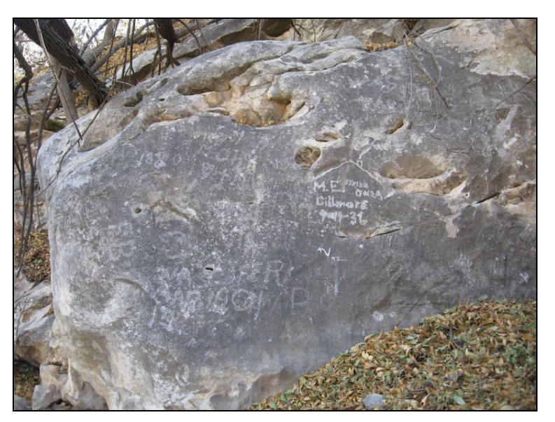
Rock inscriptions at Goodwin Spring