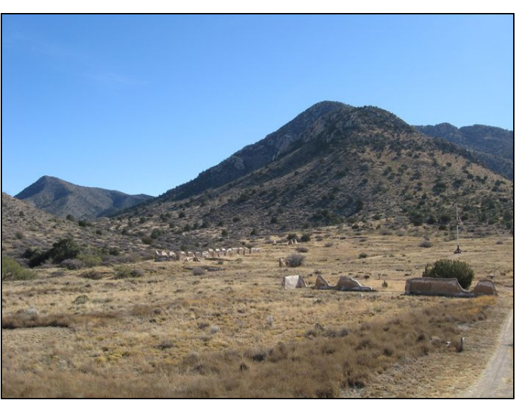
Ft. Bowie Ruins