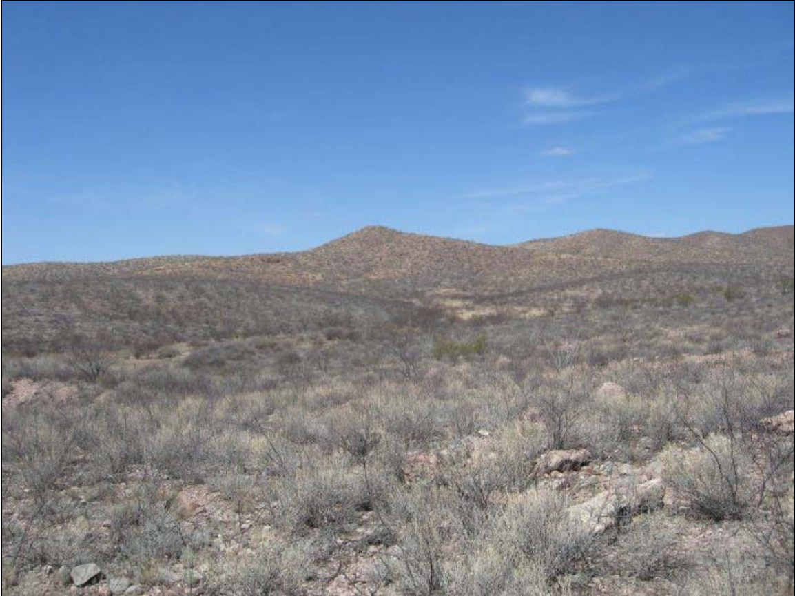
View West into Section 16