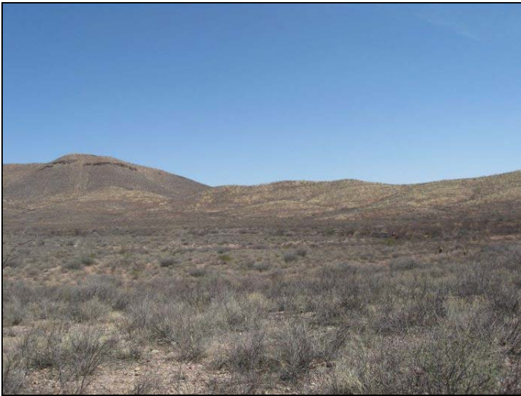
View NE into Section 10