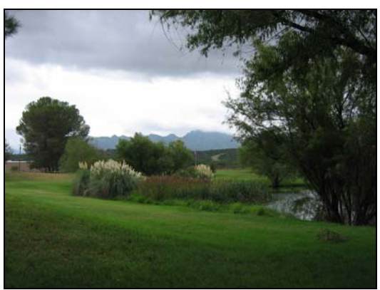
[6] View to the north