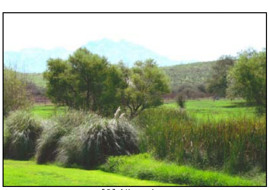
[8] Nice view