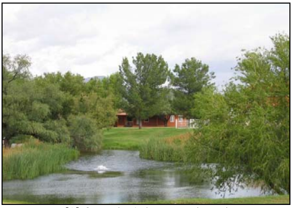
[3] Caretaker's house and pond