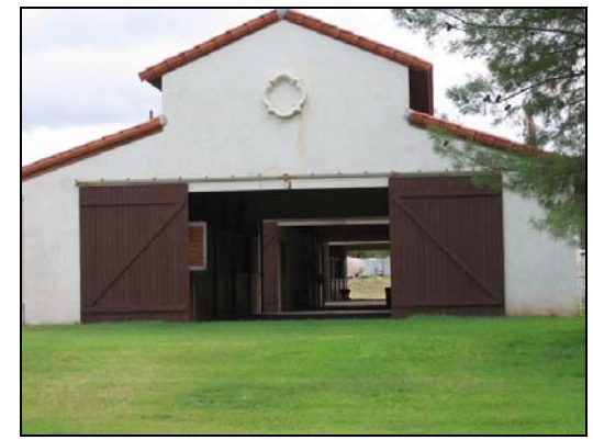
[5] Side view of the barn