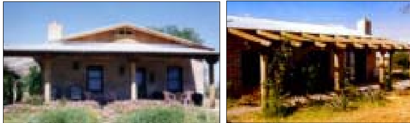
Three bedroom casita, front and side porch

The two casitas provide comfortable and charming private living space for family and friends. Built with passive solar design, the casitas are constructed of cement stabilized adobe. Each has a beehive fireplace, kitchen cupboards made of local dried saguaro ribs, floors and countertops of polished Saltillo tile and front patios with outstanding mountain views. The One Bedroom/One Bath casita is 752 square feet and has a living/dining room and kitchen. The Three Bedroom/One Bath casita is 1,174 square feet and has a living room, dining area and kitchen.