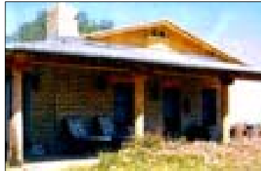
One bedroom casita

Both casitas have wrap-around patios, their columns softened by climbing roses and other vines. From the one bedroom casita, you can view the horses grazing in the pasture, backed by mountain views.