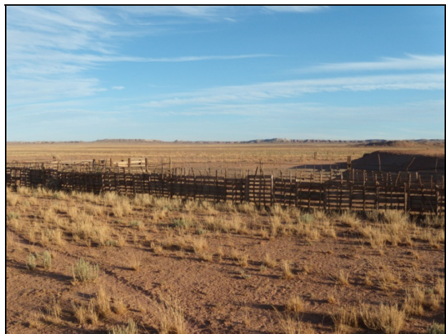
Corrals at Twin Tanks on State Lease.