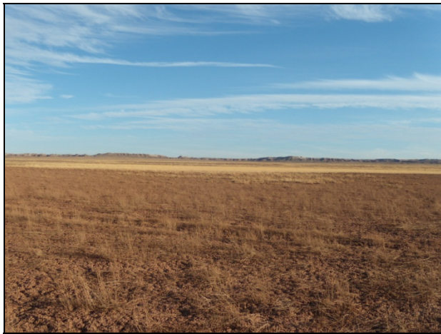
Rangeland on north end of ranch, State & Private Lease.