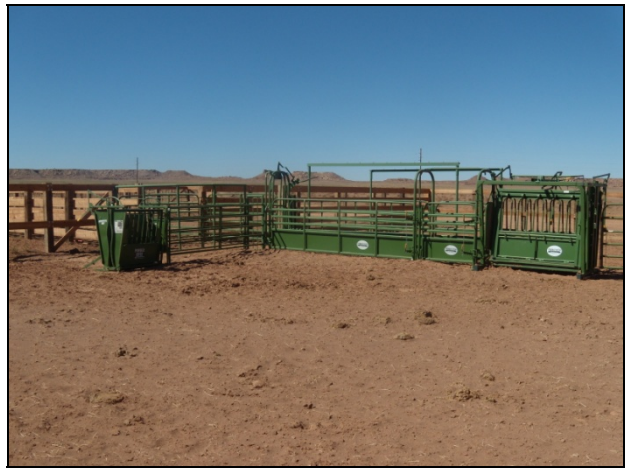
Squeeze chute, calf table and alley on deeded.