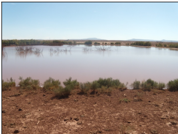
Tucker Flat Wash Tank on State Lease.