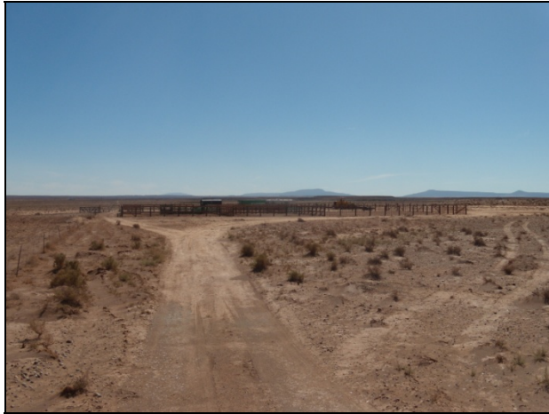
Corrals on deeded land.