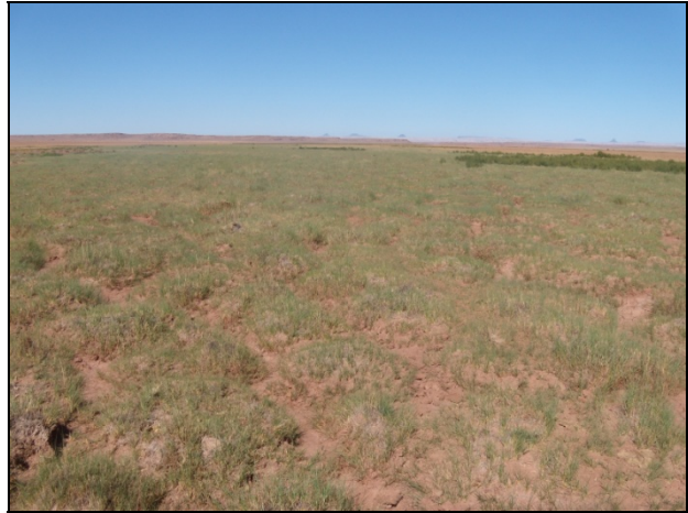
Sacaton grass on Tucker Flat, State & Private Lease.