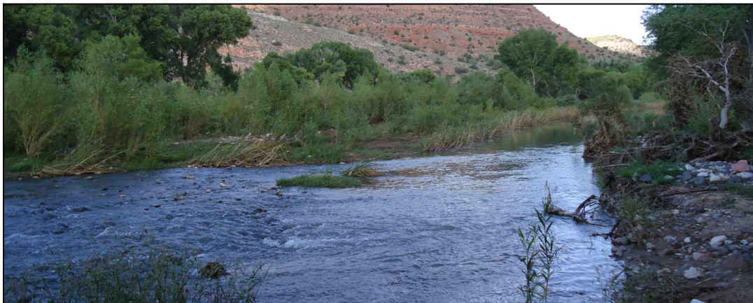
Verde River running through deeded land at the headquarters.

Other info: this claim remains in a previous owner's name but will be assigned to buyer.