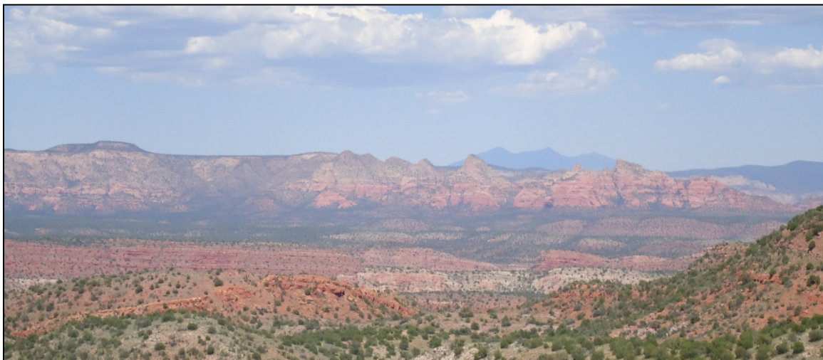
Views of Sycamore Canyon, Red Rocks and San Francisco Peaks from allotment.

Web: www.headquarterswest.com/listings/ybard