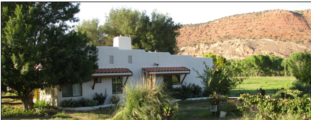
Owner's Home overlooking irrigated pasture and riparian habitat in Verde River.

Corrals: Metal pipe working corrals that have several pens/alleys, a squeeze chute, calf table and a small scale. There is also one set of working corrals with squeeze chute on the grazing allotment at Red Flat.